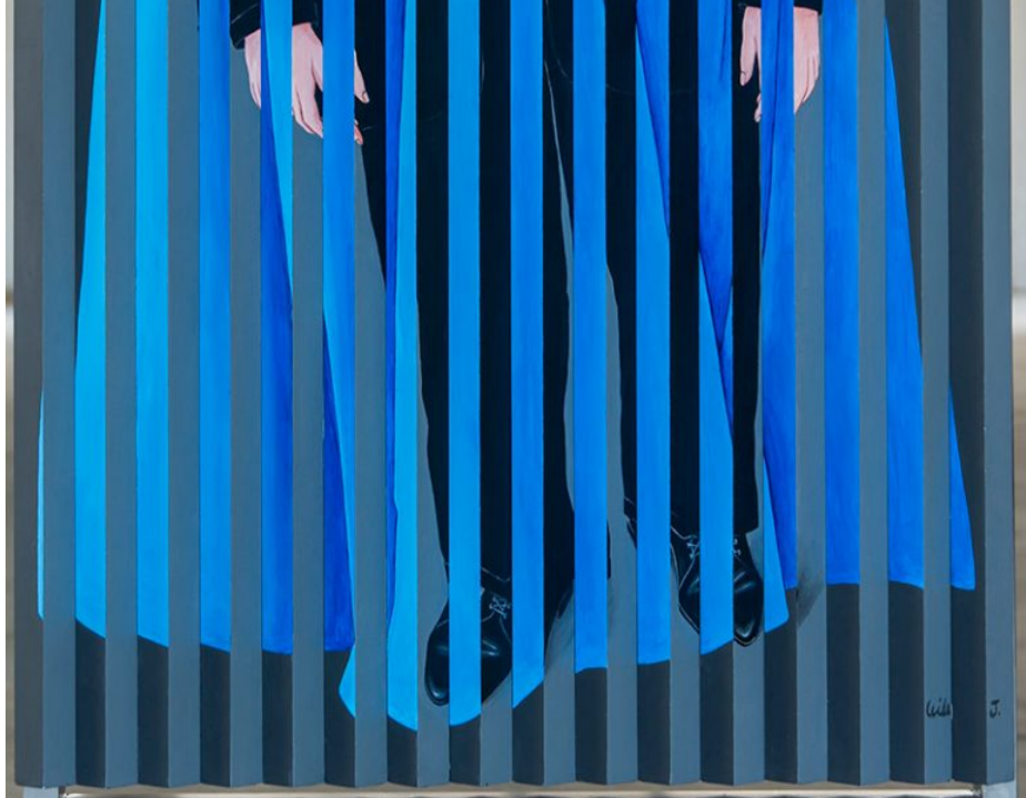
Trump (2017-2018), acrylic on wood, 80x120cm

“As one that lived with a very open and liberal family, I wanted to see what happened and to talk to women who were different from me, just to get their own stories and see what each and every one of them had to go through,” the Lebanese artist told Selections. “Was she oppressed? Was she free to do what she wanted? Study, dress as she pleases, and not be under constraint as a woman? So I had to go on the other side and check it out, to challenge my own misinterpretation. You have this misconceived idea sometimes, of women who have the veil, who wear it or remove it. It’s always interesting to talk to them, challenging one’s own opinion.”